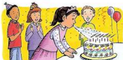
2. had a party