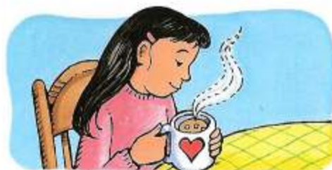
6. drank hot chocolate