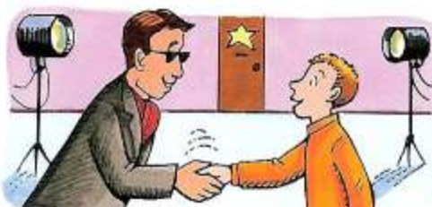
5. met a movie star