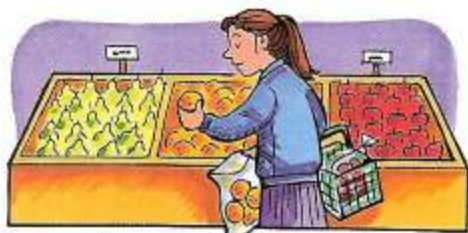
4. went to the store