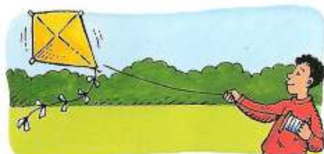
3. flew a kite