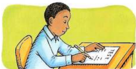
1. took a test